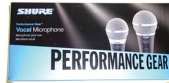
SHURE PG48 – CARDIOID DYNAMIC VOCAL MICROPHONE ON/OFF SWITCH, AVAILABLE IN HIGH OR LOW IMPEDANCE