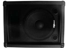
10" MONITOR CABINET DOUBLE ANGLE WITH A 10" SPEAKER AND A HORN, VERY LIGHT AND EFFICIENT