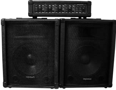
DIPLOMAT PA SYSTEM 4-CHANNEL PA HEAD W/ 2-10" SPEAKERS, 100 WATT PA HEAD, 10" SPEAKERS, 80 WATTS RMS/ 160 WATTS MUSIC, COLOR: BLACK