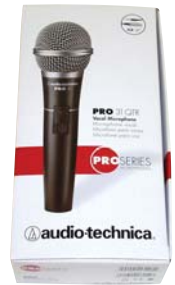
AUDIO TECHNICA PRO 31QTR – CARDIOID DYNAMIC VOCAL MIC. COMES WITH 1/4" 15 FOOT CABLE. GREAT VERSITILE VOCAL MIC.