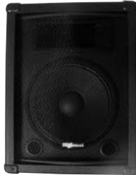
AL-612M – 12" FLOOR MONITOR 100 WATTS RMS/200 WATTS MUSIC, IMPEDANCE: 8 OHMS, CROSSOVER FREQUENCY: 40000 HZ, FREQUENCY RESPONSE: 45-20000HZ, SENSITIVITY: 92DB+2 1W/1M