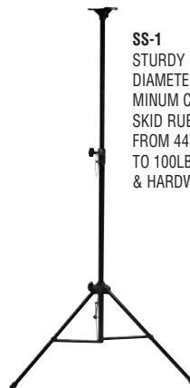
SS-1 STURDY LIGHTWEIGHT LARGE DIAMETER, TUBULAR ALUMINUM CONSTRUCTION, NON SKID RUBBER FEET, EXTENDS FROM 44" TO 78", HOLDS UP TO 100LBS, MOUNTING PLATE & HARDWARE INCLUDED