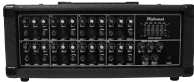
AL-608 – 8 CHANNEL POWER MIXER POWER: 150 WATTS, SPRING REVERB, INPUT, XLR, 1/4", DIMENSIONS 51.5X28X21CM