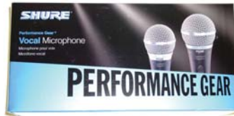
SHURE PG58 – CARDIOID DYNAMIC VOCAL MICROPHONE ON/OFF SWITCH, AVAILABLE IN HIGH OR LOW IMPEDANCE