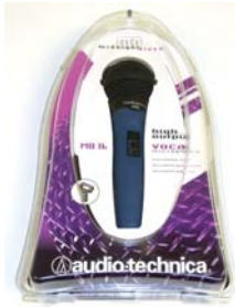
AUDIO TECHNICA MB 1K - HIGH OUTPUT UNIDIRECTIONAL DYNAMIC VOCAL MICROPHONE GREAT VOCAL MIC FOR A LOUD LIVE SETTING LIKE A ROCK BAND, FEATURES A HI-ENERGY NEODYMIUM MAGNET, MAG-NALOCK SILENT ON/OFF SWITCH, GOLD PLATED XLRM TYPE OUTPUT CONNECTOR, ALL METAL CONSTRUCTION