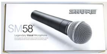
SHURE SM58 – CARDIOID DYNAMIC VOCAL MICROPHONE "THE INDUSTRY STANDARD", AVAILABLE IN HIGH OR LOW IMPEDANCE