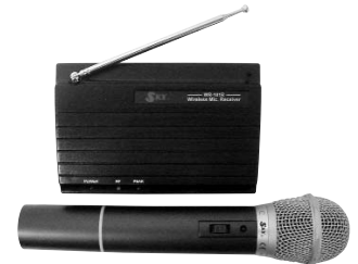
DYNAMIC WIRELESS HAND HELD MICROPHONE FREQUENCY RESPONSE: 50-15000HZ, DYNAMIC RANGE: 100DB, TYPE OF EMISSION: FM, CARRIER FREQUENCY RANGE: 160-245MHZ, SENSITIVITY RATIO: .90DB, AC ADAPTER INCLUDED