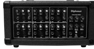
AL-606 – 6 CHANNEL POWER MIXER POWER: 150 WATTS, SPRING REVERB, INPUT, XLR, 1/4", DIMENSIONS 44X28X21CM