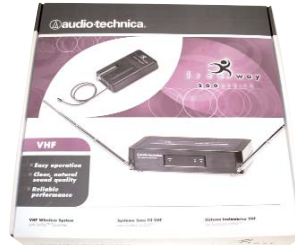
AUDIO TECHNICA ATW-251/G – WIRELESS MICROPHONE SYSTEM AVAILABLE IN GUITAR, HAND HELD, HEAD SET MIC, AND LAVALIER