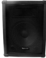
AL-612C – 12" SPEAKER CABINET 100 WATTS RMS/200 WATTS MUSIC, IMPEDANCE: 8 OHMS, CROSSOVER FREQUENCY: 40000 HZ, FREQUENCY RESPONSE: 45-20000HZ, SENSITIVITY: 92DB+2 1W/1M ALSO AVAILABLE WITH 15" SPEAKER