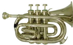
PT-1 - POCKET TRUMPET LACQUERED BRASS FINISH, NICKEL PLATED PISTONS, MOUTHPIECE INCLUDED, CARRYING BAG INCLUDED