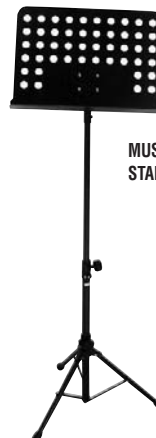
MUS-1 MUSIC STAND