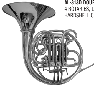
AL-313D DOUBLE FRENCH HORN 4 ROTARIES, LACQUER FINISH, HARDSHELL CASE INCLUDED