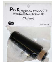
MOUTH PIECE KITS CLARINET (PICTURED) TENOR SAX ALTO SOPRANO SAX