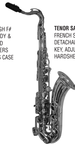
TENOR SAXOPHONE FRENCH SUPER STYLE WITH DETACHABLE BODY, HIGH F# KEY, ADJUSTABLE KEYS, HARDSHELL CASE INCLUDED