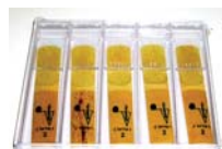
NARRAGANESTT REEDS ALL SIZES