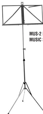
MUS-2 FOLDING MUSIC STAND