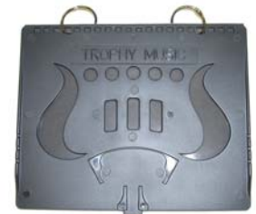
FLIP FOLDERS FOR MARCHING BAND (YES WE HAVE A LARGE SUPPLY OF LYRES TO HOLD THE FLIP HOLDERS)