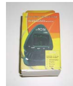
INTELLIGENT TUNER FULL CHROMATIC CLIP ON TUNER, FULL 360 DEGREE SWIVELABLE, BACKLIT