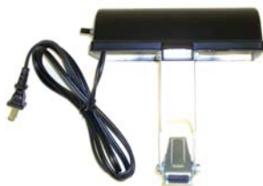
MUSIC STAND LAMPS VERY TIGHT GRIP TO HOLD ONTO ANY STYLE MUSIC STAND, COMES WITH BULB.