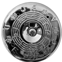
CHROMATIC PITCH PIPE