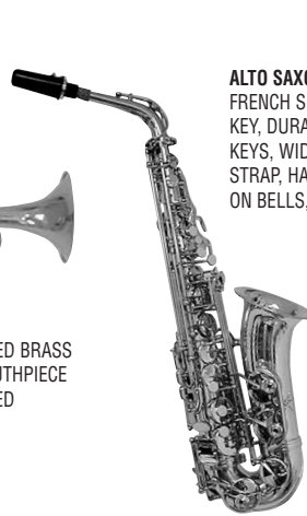
ALTO SAXOPHONE FRENCH SUPER STYLE, WITH HIGH F# KEY, DURABLE GOLD-PLATED BODY & KEYS, WIDER SHOULDER PADDED STRAP, HAND ENGRAVING FLOWERS ON BELLS, WOOD SHELL OR ABS CASE